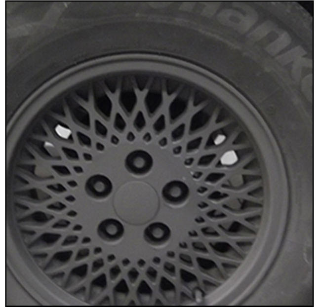
The windows (left) are tinted with matte black vinyl and wheels (right) are sprayed with a flat black finish to minimize reflective light.

T hrough our field experience we have learned from our customers about the need for laser safe operations. We have produced some simple and effective ways that will help minimize reflective laser light. During aircrew training exercises, a combat laser is used to direct ordinance, designate targets, measure distances, etc. These laser designators fire coded pulses of laser light at a target, which is then reflected from the target's surface. The reflected