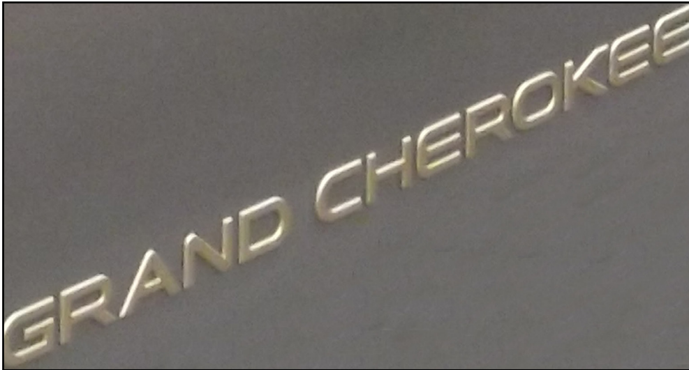
The emblems should be removed from the vehicle to minimize reflective laser light that could cause eye damage.

While the requirement for laser eye protection for anyone in close proximity to the target is not eliminated, the risks to unsuspecting personnel is reduced.