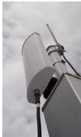
Radio Assembly and Set-up v.01.01.01