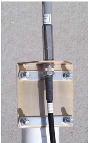
Company Confidential © 2013, Kairos Autonomi® Scalable Autonomy™

The "POE" and "Enet" ports both accept standard Cat5e cables; however, the ports themselves are NOT interchangeable. Connecting a power over Ethernet (POE) source to the 'Enet' port WILL damage the Radio Enclosure, and WILL require repair by Kairos Autonomi personnel.