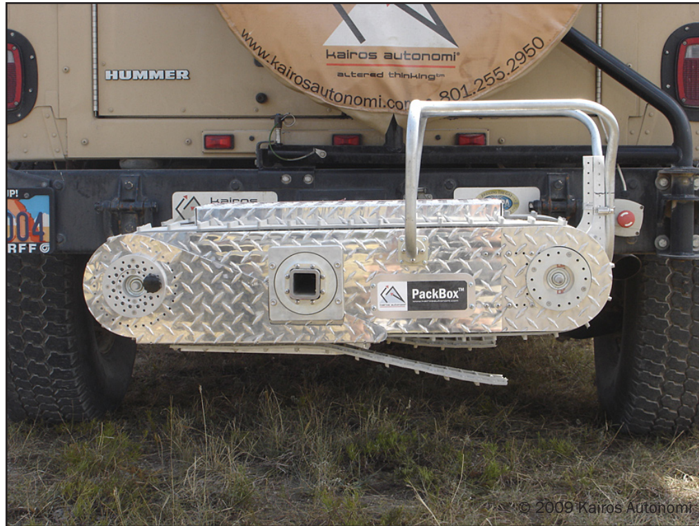
The Kairos Autonomi TrackBox™ attached to the standard hitch receiver of a HMMWV.

A man-portable, mobile deployment carrier for PackBot® capable of use with any standard hitch receiver