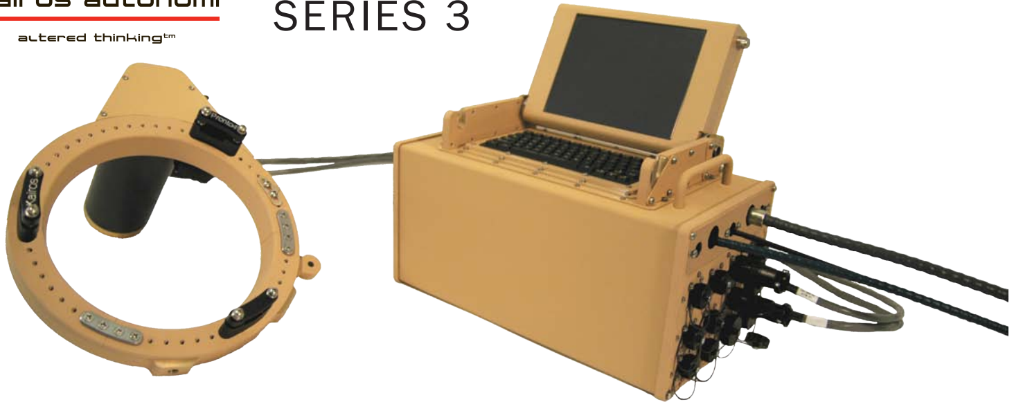
A Pronto4™ Strap-on Autonomy System Series 3 with optional attachable LCD display and keyboard.

The Pronto4™ Strap-on Autonomy System converts any existing ground vehicle or surface vessel — either steering-wheel or skid-steer — into an unmanned system in less than four hours. Featuring scalable autonomy, the Pronto4™ system* allows for vehicle control ranging from tele-operation to semi-autonomy. Whatever the situation, the Pronto4™ system provides a superior unmanned vehicle solution at an unrivaled price.