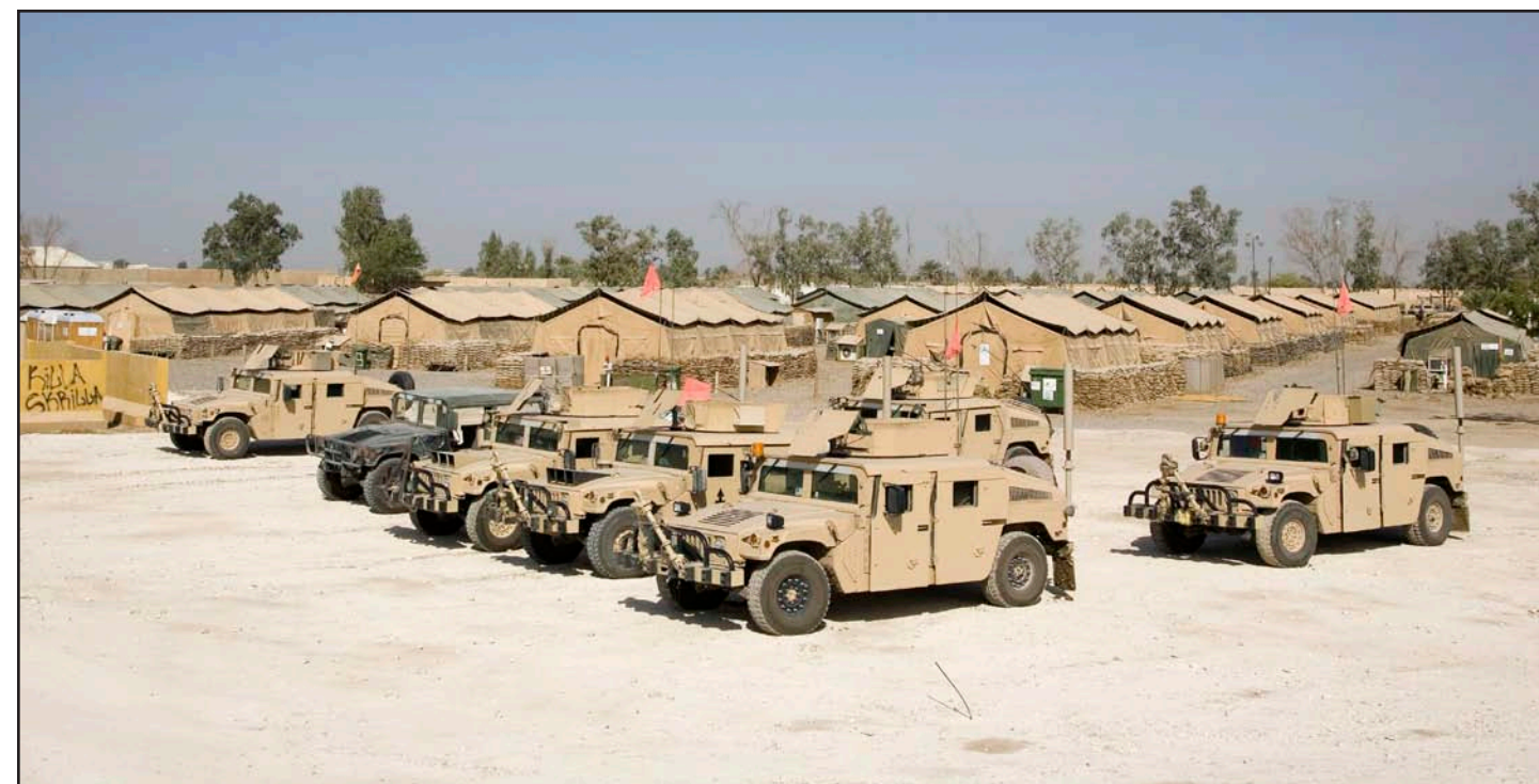
The Pronto4™ system can be field installed in less than four hours and has been installed on a wide variety of vehicles, such as military HMMWVs.